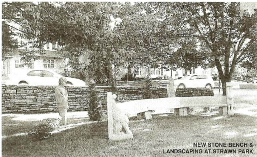
NEW STONE BENCH & LANDSCAPING AT STRAWN PARK

HOMES ASSOCIATION NEWS • KANSAS CITY, MO 64113 • SUMMER 2005